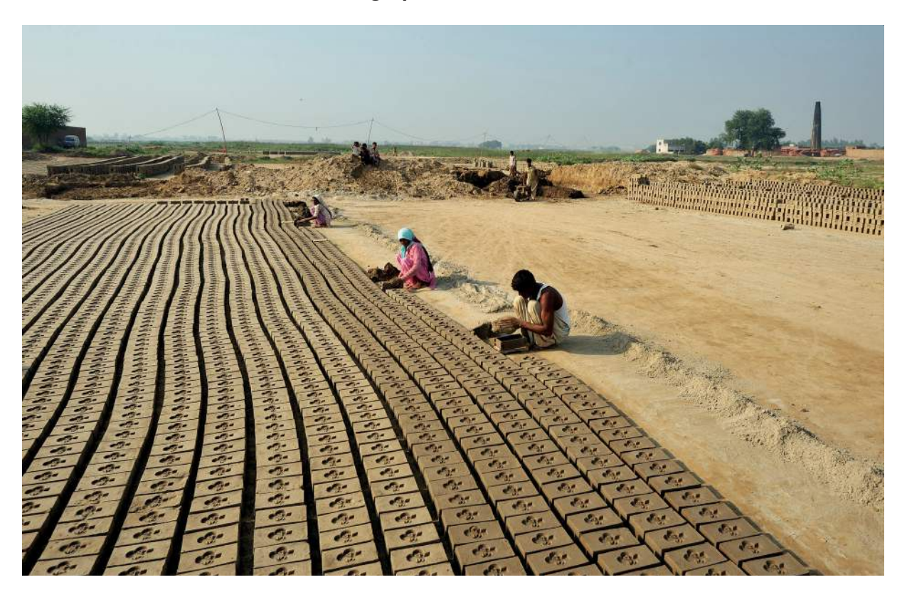
Photograph C for Question 2